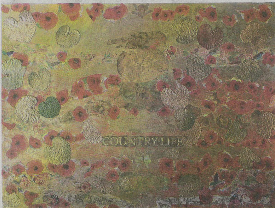
Country Life by Leonore Tolegian Hughes