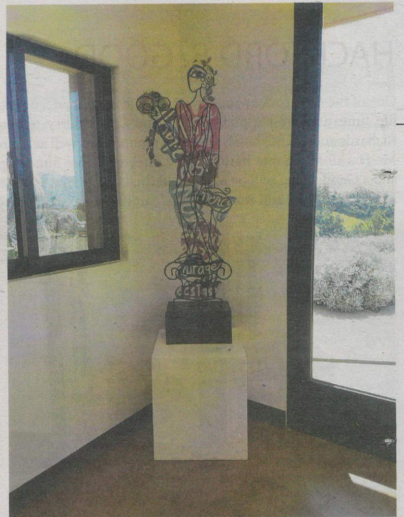
Muse by Leonore Tolegian Hughes