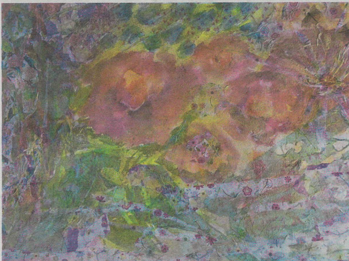
Watercolor Collage by Leonore Tolegian Hughes